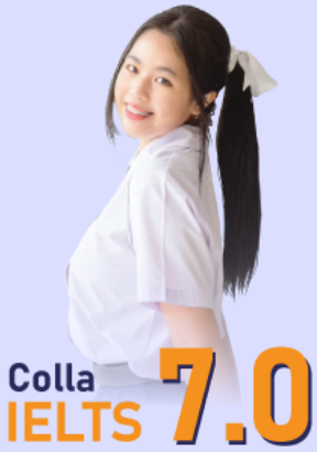
Colla IELTS 7.0