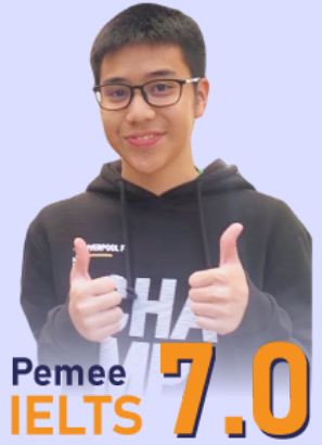
Pemee IELTS 7.0